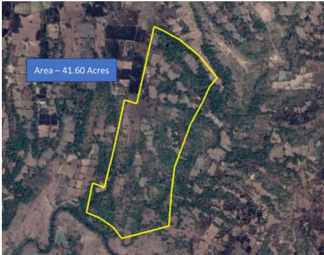
Figure 1 -Geographical tagging of Site location