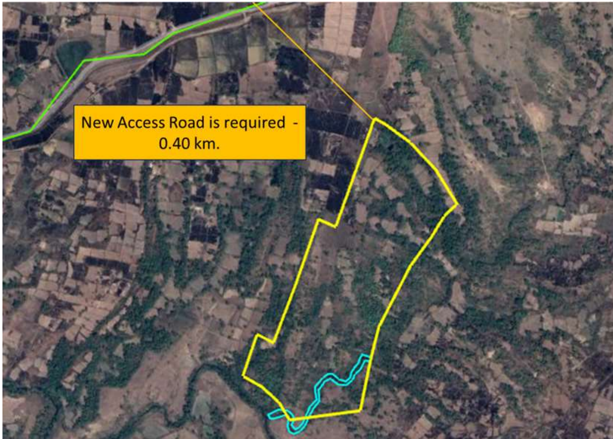
Figure 2: Access Road to Land parcel

New access road is required to develop till the Site location. The distance from the existing road upto the site is 0.40 km.